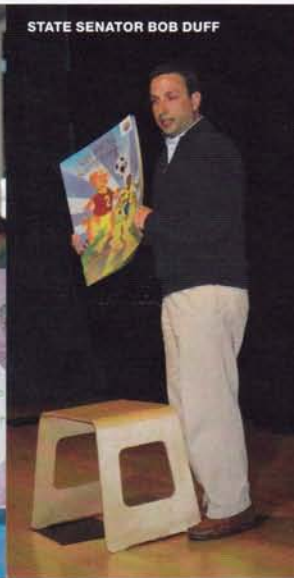
STATE SENATOR BOB DUFF